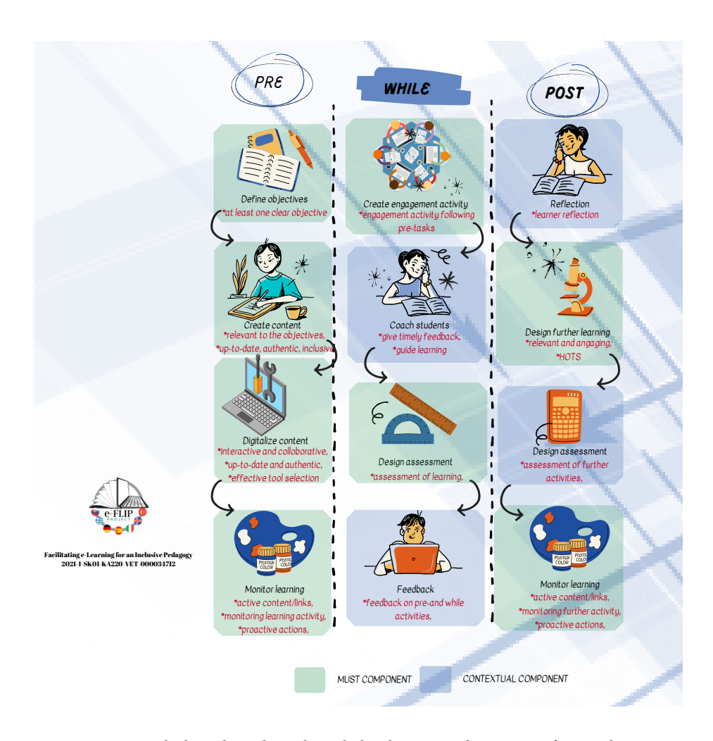
Figure 2. Stages which guide students through the planning and execution of e-FLIP lessons